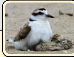
Nesting Snowy Plover

Continue riding along the trail, it will become smooth and paved. Your next stop will be about a half-mile ride until you reach a bench and sign entitled "Wetland Dune Hollows" on your left.