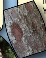
Sitka Spruce Cone & Bark

6 You'll know the Sitka by its bark, It's patchy and scratchy, but not so dark. You've seen their cones along the way, They're soft like paper or rope with fray.