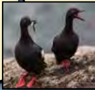
Pigeon Guillemot

3 Across the way another life form clings to the rocks, Here flocks a sea bird, the Pigeon Guillemot , To fearlessly nest on these rocks, In what looks like bright red socks!